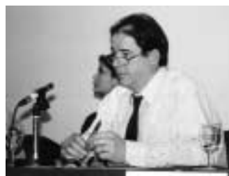
Jonathon Porritt chairs the multi-stakeholder afternoon panel

A fter the lunch break, a multi-stakeholder panel was invited to outline the priority issues and recommendations of their respective groups for Earth Summit 2002. Jonathon Porritt (Chair, UK Sustainable Development Commission) maintained an energetic debate between the panel and delegates. The session provided an effective platform for stakeholders to inform the audience with up-to-date accounts of the preparations currently underway for the WSSD, and to use the delegates as a sounding board to gain wider feedback on their priority issues.