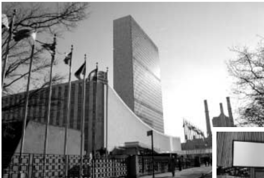
WSSD PrepCom II begins on a sunny New York day