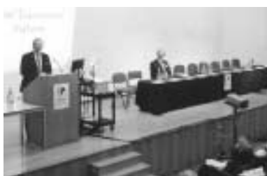
Mr. Gummer addresses a sold-out house

The spirit of the day was set early-on by an inspiring keynote speech by John Gummer . Emphasising the need for a bottom-up approach to provide the foundation of any initiative arising from the WSSD, he endorsed the need to put practicality at the heart of what we ought to be doing. Confidence and energy must be placed in a process, which produces practical activities involving Government, business and all other stakeholder working together to achieve real change. Government appear, for the first time, to be united in its commitment to issues pertaining to sustainable development. However, there is still a need for this Government to acknowledge that sustainable development is something that the UK needs to do well in. It is the responsibility of stakeholders to ensure that Government holds true to such commitments. Between January and August 2002, the UK government must clearly identify what it is going to offer, deliver, and seek to achieve at Johannesburg.