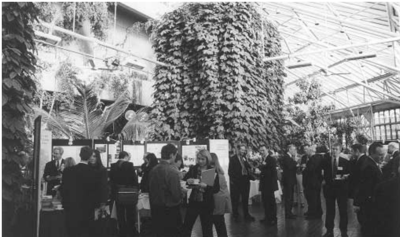
Beacon Projects honoured at a Barbican Centre exhibition