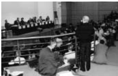
The morning panel is questioned by a standing room only audience