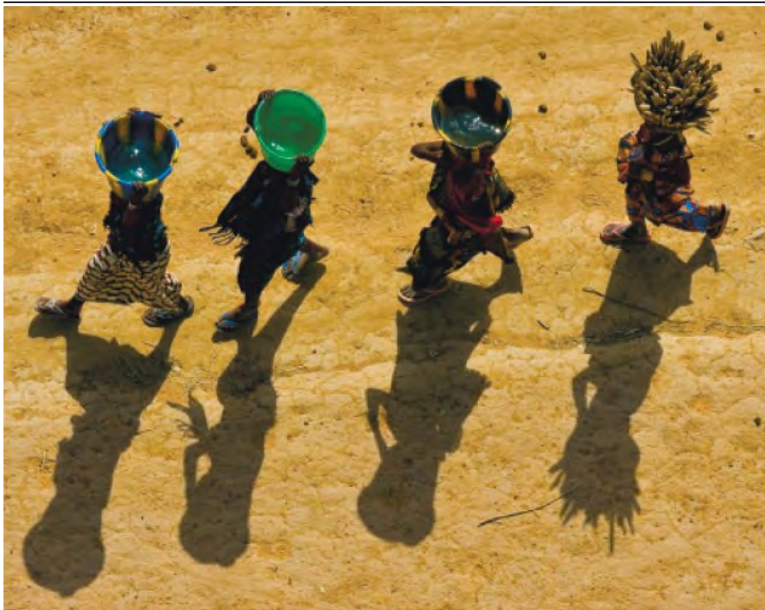
By: Zak Bleicher, United Nations Non-Governmental Liaison Service (UN-NGLS)